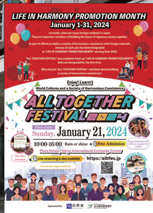
Flyer for the event “ALL TOGETHER FESTIVAL”